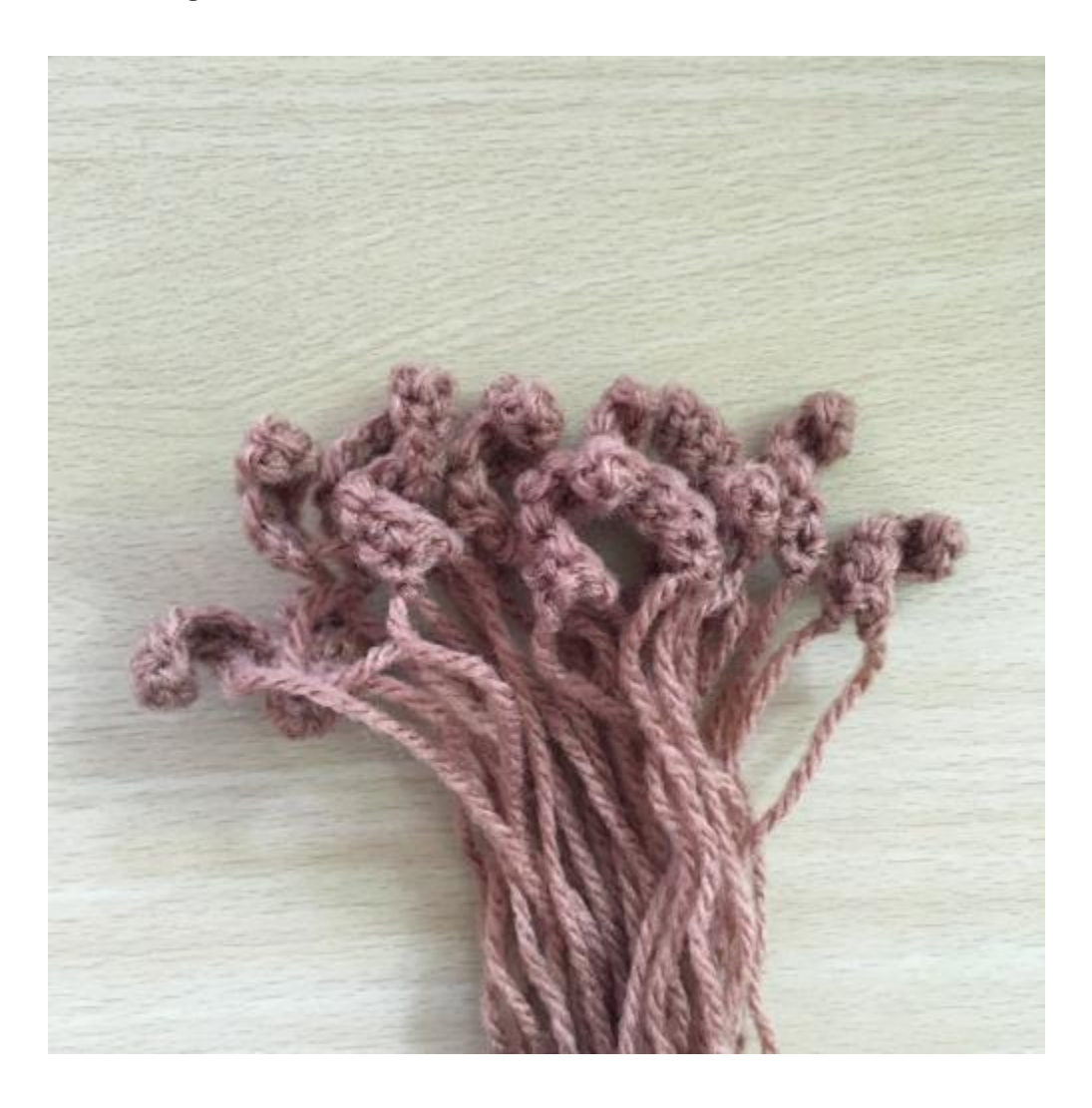
ARM (make 2)

Leave a tail for each one, long enough to use it to attach to the head later on. The hair is probably the trickiest part of the pattern, and it's not necessarily tricky, just time consuming.