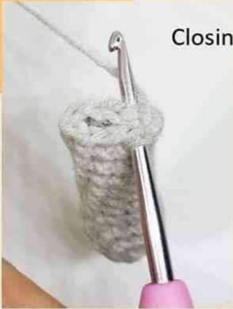
Closing the arm